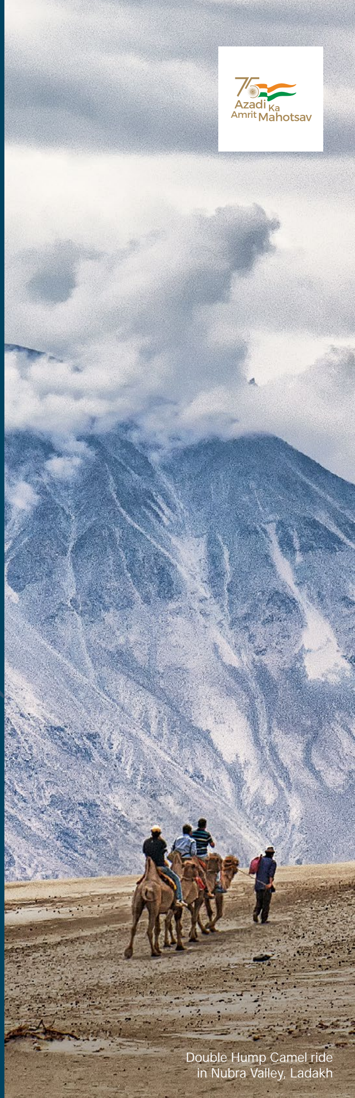
Double Hump Camel ride in Nubra Valley, Ladakh