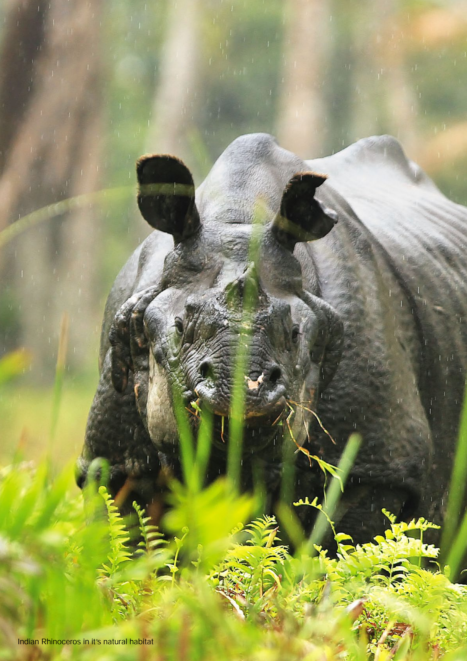
Indian Rhinoceros in it's natural habitat